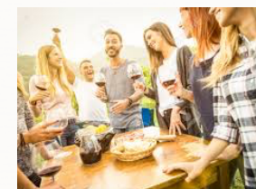
A club to experience the best wines

A unique concept to enjoy Argentinian wine without needing to leave your home. Every month you get a nice box with three 385cc or 187cc bottle (just the right amount) of wine or bubbles to taste and enjoy. Plus you get cards to understand and grow your knowledge and become a connoisseur.