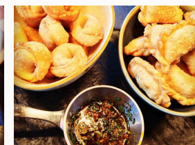
Empanadas as finger food for whole meal to share.