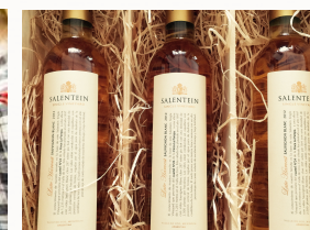
The best brands in convenient home delivery