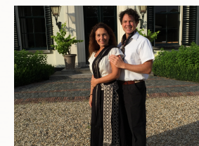
Gauchos clothing one of Argentina's cultural icons

To expand your wine experience we offer travel packages to the wine destinations in Argentina. Whether you want to know a far away land that hosts one of the best wine regions in the world, get excited to create your own wine and label or even invest in your own terroir or exclusive wine, this service is a must do for you and your friend and family.