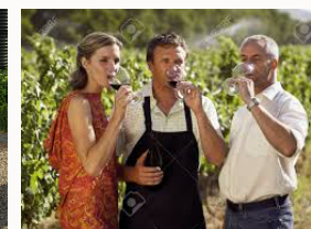
Enjoy wine at the foot of the Andes in contact with Nature